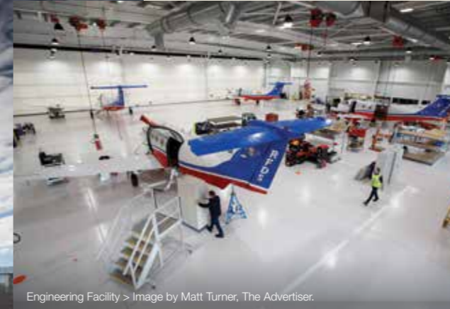
Engineering Facility > Image by Matt Turner, The Advertiser.