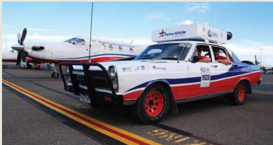
RFDS 'Car 1928' entry in this year's OZ Outback Odyssey.

AN ENTHUSIASTIC TROOP of 24 pre-1985 model rally cars and 4WD support vehicles completed a gruelling eight-day journey through the Australian outback to raise funds for the Flying Doctor.