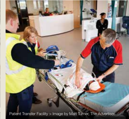
Patient Transfer Facility