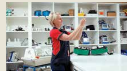
Patient Transfer Facility > Image by Matt Turner, The Advertiser.

A NEW $13 MILLION state-of-the-art aeromedical base has cemented RFDS Central Operations' role as the provider of fixed-wing emergency retrieval and interhospital transfer services for South Australia for decades to come.