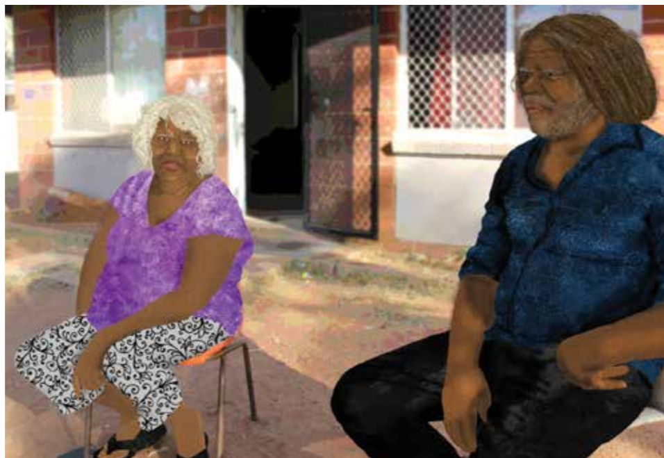
A still from the Worry Boss video.

WHEN THERE IS no spoken or written word for ‘anxiety’ in a language it can take some careful thinking to find a way to talk about a problem with anxiety in the community.