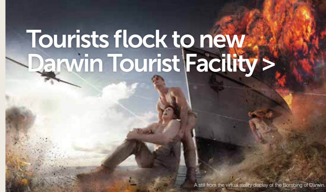
A still from the virtual reality display of the Bombing of Darwin.

MORE THAN 10,000 TOURISTS have explored two iconic Australian stories at the new RFDS Tourist Facility at Darwin's historic Stokes Hill Wharf in the first two months of its opening in July 2016.