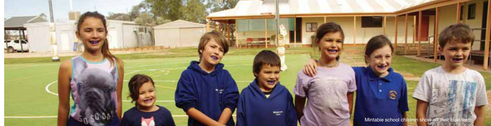
Mintabie school children show off their blue teeth

Using animation, the story depicts a conversation between an Aboriginal man and an Elder woman, who asks what’s troubling him. The chat leads to her helping him to realise the difference between his every day worries and worries that make him feel angry and unfocused.