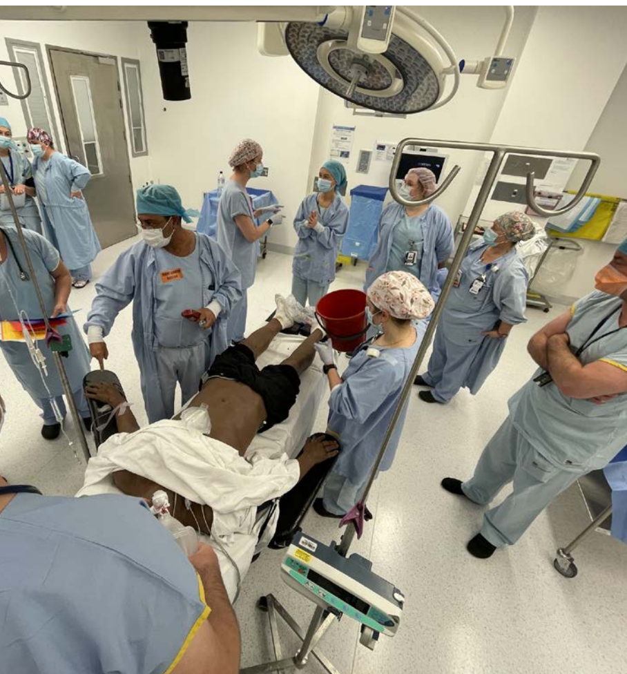
Simulation at Dubbo Hospital

“These partnerships with education at the heart, are crucial in creating impact, through raising the standards of excellence across industry and the RFDS. Our staff need to be sharp. They deal with some of the most striking trauma. It’s one thing seeing trauma in a hospital, but it’s an entirely different story when you are the first on scene. Practicing these scenarios is non-negotiable and through partnerships to deliver these courses, we give medical practitioners the opportunity to practice focussing under this pressure.”