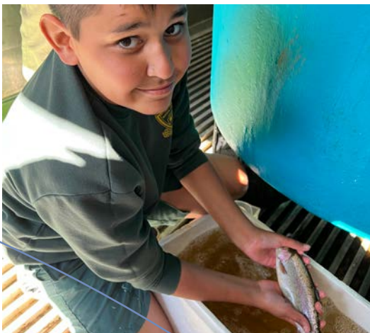
Above and left: learning about aquaponics through the GROW program