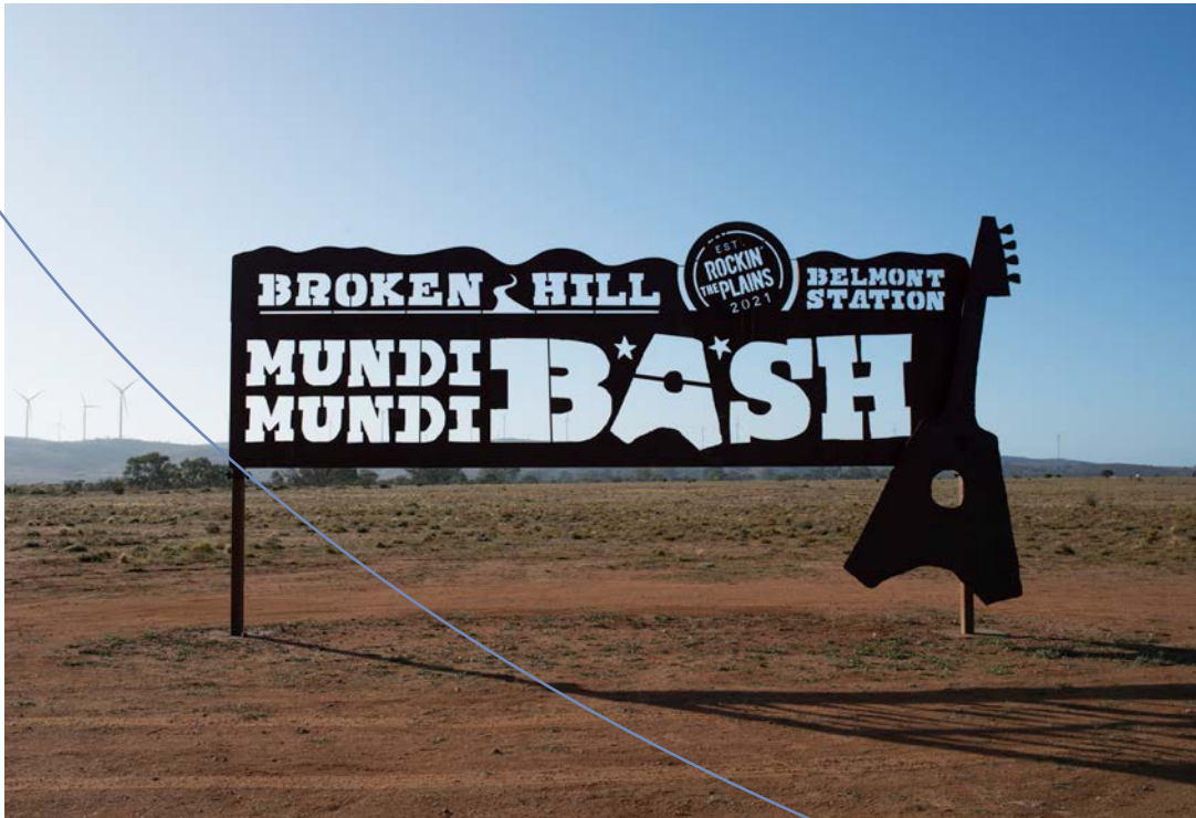
The Mundi Mundi Bash in 2022 raised in excess of $90,000 for the RFDS