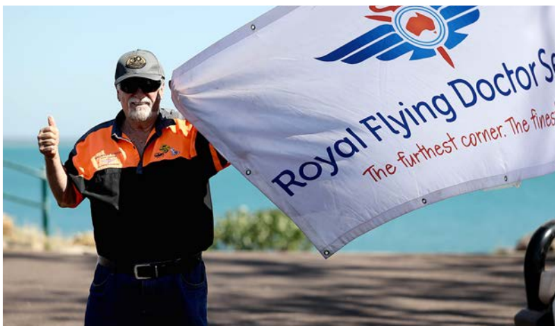
Outback Car Trek

“Getting supporters connected to the area of service they are most passionate about and providing them with transparency about the impact that their gift delivers, is incredibly important to us.”