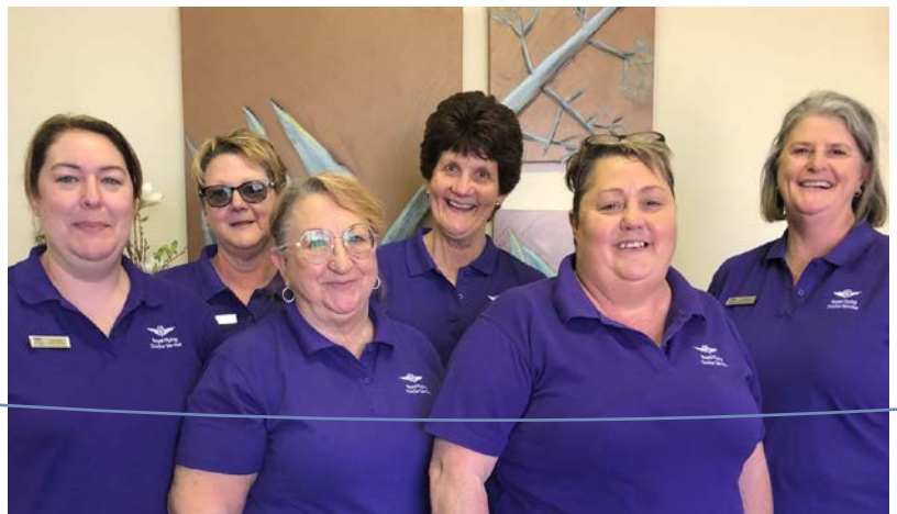
Yunta Womens' Health Day