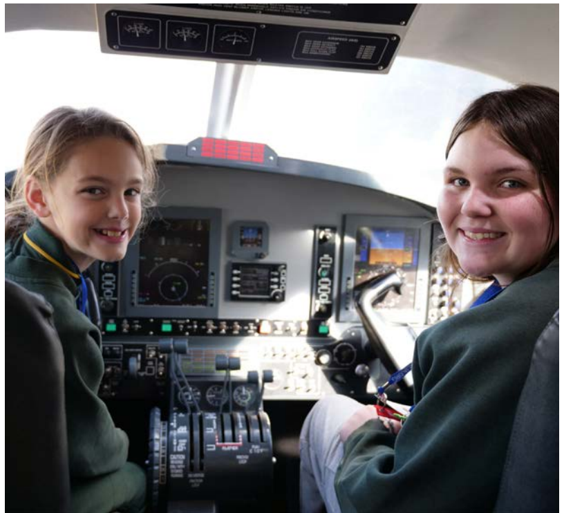
Girls learn all about what a potential career in aviation looks like during the Women in Aviation Day in Dubbo

> At one recent health clinic in remote NSW, it was discovered a large number of First Nations women had never been offered a full health assessment. It's well documented; the more remote you get, the greater the challenge of accessing medical services and social connection. Which is why the RFDS took nurses, a mental health worker, a breast care nurse, and some great food, to the furthest corners as part of its Women's Healthy Living Days program. Women came together for health checks, for conversation and education around the latest information concerning women's health.