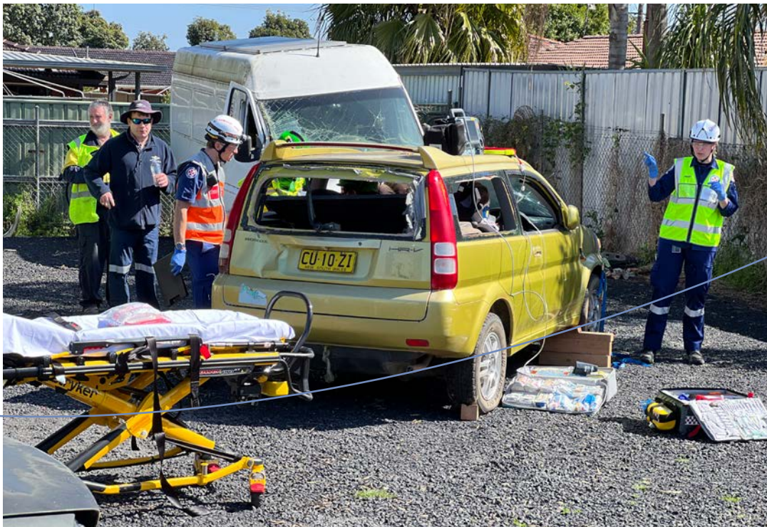
VRA, RFDS and NSW Ambulance simulation training

> When around 40 young GPs from remote and isolated towns in Western NSW arrived on a remote farm with RFDS medical staff, they were shocked at what they saw. A man (an actor) with a (fake) gunshot wound lay on the ground, (fake) blood everywhere, and a (toy) gun lay close by. The adrenalin starts pumping. For most of the group, their initial instinct was to run in and treat the gunshot wound. They quickly learnt the first thing to be done was secure the scene, move the gun and make sure the area was safe.